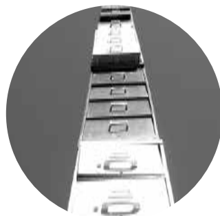
South End sculpture constructed by Bren Alvarez

Burlington IRS Office: 128 Lakeside Ave. | (802) 859.9308 | www.irs.gov